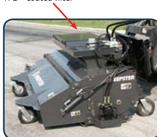
Washable PTFE - coated filter